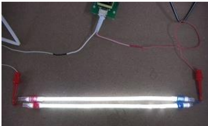
Figure 1 Photopicture of prototype of coil-EEFL lamps in parallel connection. Coil-EEFL lamps are converted from the commercial CCFL lamps.

The formation of the cathode and anode by the volumes of the glow light on the polarized phosphor particles is the third generation (3G) electron source [1, 2, 3]. Figure 2 shows the photograph of the prototype of the developed coil-EEFL lamp. We may confirm the formation of the internal DC electric circuit from the photograph shown in Figure 2. Thus, the unsolved lighting mechanisms of the FL lamps for 90 years have solved by the new findings of the formation of the volume of the glow lights on the polarized phosphor particles under the electric field of the external driving circuit.