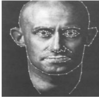
Fig 4: Field Morphing

In Figure 4, 127 sections are drawn over the forms and highlights of the face. In the twisting period of field transforming, correspondences are determined between the pixels of the pictures to be transformed. The calculation is called field transforming in light of the fact that each line fragment applies a field of effect on the arrangement to such an extent that pixels close to a portion in one picture will in general be lined up with pixels close to the comparing section in different pictures. Under a specific parameter setting, the calculation ensures that pixels on a fragment in one picture will be lined up with the pixels on the comparing section in different pictures. I will now initially clarify the field transforming strategy with only a solitary control line section and after that clarify the method with multiple control line segments.