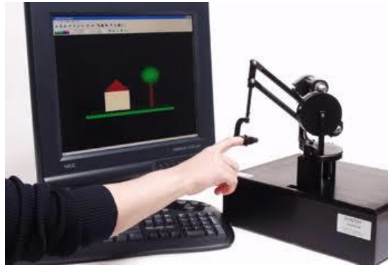
Fig: 4 Phantom (Haptic Device)

it's far a small robot arm with 3 revolute joints every related to a computer-managed electric powered DC motor. This haptic interfacing device is evolved by means of realistic technology and is the main haptic tool used in studies. It is frequently used for imparting a 3-d touch to the digital items. That is a totally excessive resolution, six stages of freedom (DOF) device wherein the person holds the stop of a motor-managed, jointed arm. a programmable experience of contact that permits the user to feel the texture and form of the digital items with a totally excessive degree of realism. Certainly one of its key features is that it could model unfastened-floating 3-dimensional objects