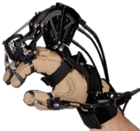
Fig 4: Cyber glove (Haptic Device)

it's far a small robot arm with 3 revolute joints every related to a computer-managed electric powered DC motor. This haptic interfacing device is evolved by means of realistic technology and is the main haptic tool used in studies. It is frequently used for imparting a 3-d touch to the digital items. That is a totally excessive resolution, six stages of freedom (DOF) device wherein the person holds the stop of a motor-managed, jointed arm. a programmable experience of contact that permits the user to feel the texture and form of the digital items with a totally excessive degree of realism. Certainly one of its key features is that it could model unfastened-floating 3-dimensional objects