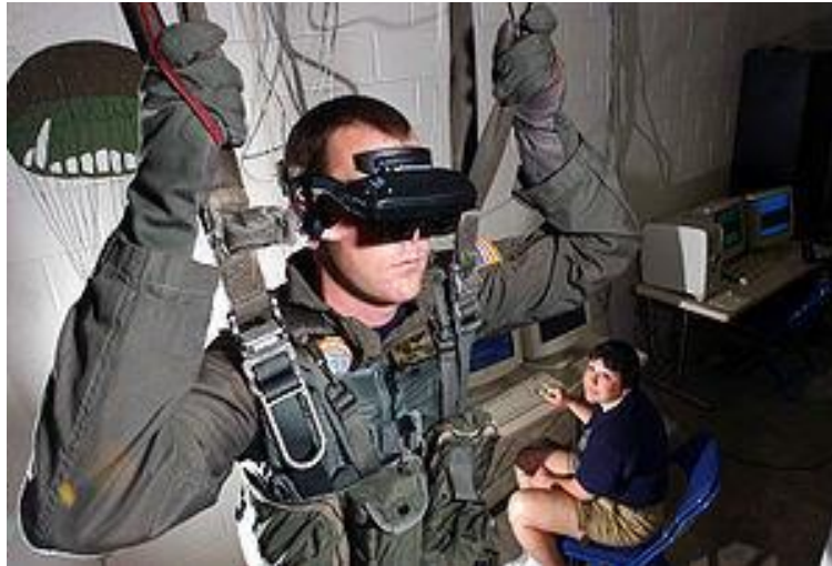
Fig: 2 Virtual environment